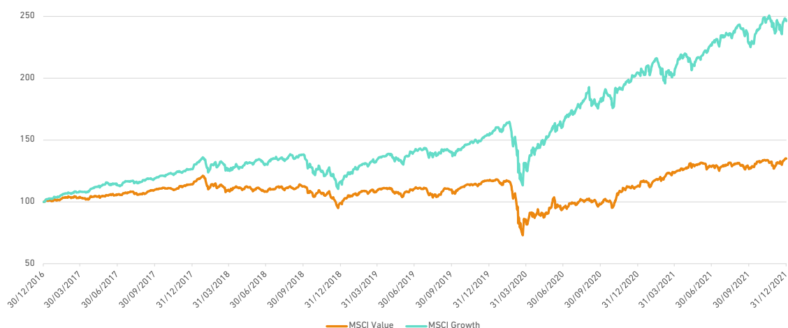
Value vs Growth 5 years prior to 2022

My favourite example of this is looking at value vs growth. The chart below shows the MSCI growth and value returns for investing £100 in the five years running up to 2022: